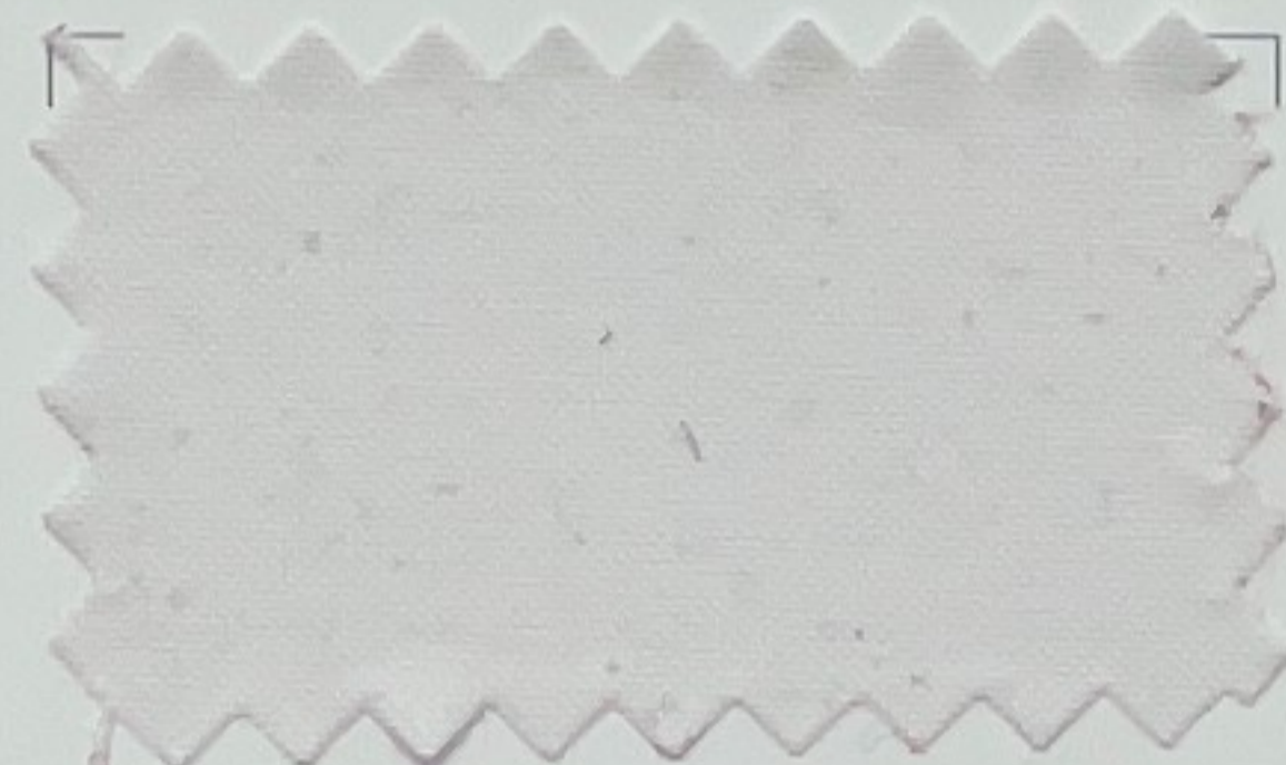
ecru (nur 300 cm only 300 cm )